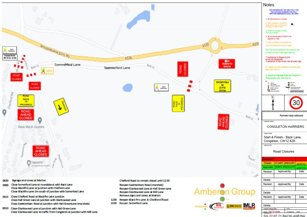
Start area closures